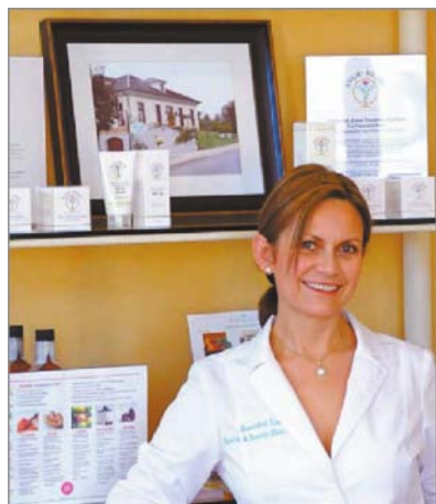
The amazing Geomare Avilés

Geomare Wellness Center is located at 80 White Street in Southampton Village. For Ciel Acupuncture, Body Massage Therapy, Rejuvenating Facials, Nutritional Counseling and Aqua Max Inc., visit geomarewellnesscenter.com or call 631-287-9352.